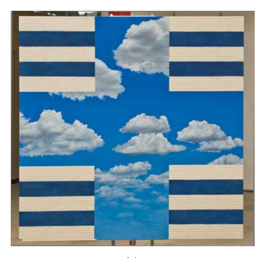
Seeing Oil on Canvas | 160 x 60 inches | 2011