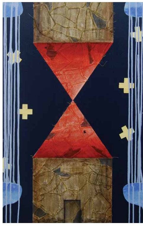
Torn Acrylic, Enamel, Thread, Paper on Canvas 60 x 60 inches | 2011

She had a peer in graduate school who was making handmade paper and